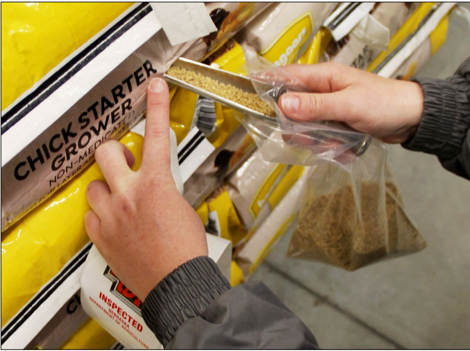
At a farm supply store, a livestock feed sample is extracted using a probe.

Those were Mills' objectives as she headed into the farm supply store. She immediately went to the livestock feed and pet food section and examined the area.