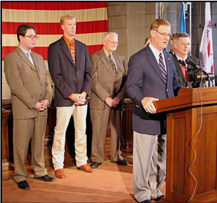
Senator Tom Carlson, flanked by Governor Dave Heineman, addresses the audience during the May 1, 2007, signing of LB 701.

On May 1, 2007, Governor Dave Heineman signed into law LB 701, comprehensive water legislation that included riparian vegetation management activities originally included in a bill introduced by Senator Tom Carlson, LB 458. With an emergency clause attached, the legislation went into effect immediately. Sections 1 and 2 of the legislation created the Riparian Vegetation Management Task Force and assigned it specific responsibilities. This report reflects the requirements of Sections 1 and 2. Sections 3 and 4 of the legislation created a grant program for management of riparian vegetation, and stated the Legislature's intent to appropriate $2 million annually for this purpose. A separate report on the grant program is included as an addendum.